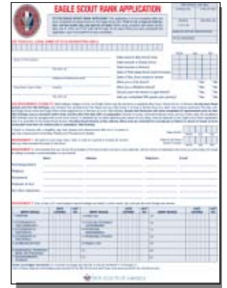
Eagle Application #512-927

The form itself can be filled out by hand. But if so, everything must be legible, with no cross-outs or white-out corrections. Also make sure that each box contains only one character.